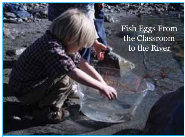
On February 9, Forks' younger students (K-3<sup>rd</sup> grade) released salmon fry that they raised in the classroom aquarium. The fish were released into the Klamath River upstream of the confluence with the Salmon River. The Klamath River temperature was 48 degrees Fahrenheit, the same temperature as the aquarium that morning. It was an incredibly beautiful day, the first sunny, warm day of the year and we had a wonderful experience.

This past year in the SRRC Watershed Ed Program (funded by CDFG), AmeriCorps Michael Kein and Bill House, Junction's Laurie Belle Adams and I have been having fun teaching about many aquatic communities. We've raised fish eggs in the classroom (and later released the fish), sampled and identified aquatic macroinvertebrates, and observed local amphibians (Frogs! Toads!).