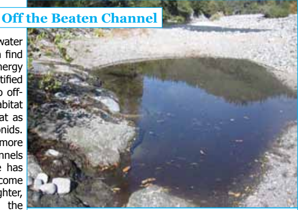
production of slow back waters necessary to salmon fry in the high

off-channel refugia from high water and predators where they can find food easily, conserve their energy and grow. Biologists have identified both the loss of and access to offchannel winter rearing habitat and cold water summer habitat as key limiting factors to salmonids. Historically there were many more meandering and braided channels in the Salmon. Past land use has caused sections of river to become more channelized. These straighter, quicker flows work against the necessary to salmon fry in the high water of Spring.