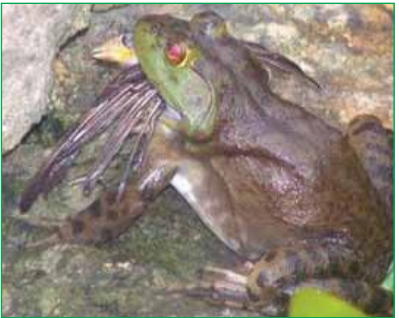
Bullfrog eating a young songbird

Within the Salmon River watershed, there are ZJ Y species of frogs and toads which may be found: the 7cUgU Tailed Frog, Western Toad, Pacific Tree frog, Foothills Yellow-legged Frog, and Bullfrog. These species of frogs all utilize riverine and wetland habitats as breeding grounds and general habitat. Of these six species of frog, five are native to the Salmon River and its watershed. The one exception is the bullfrog.